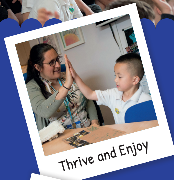
Thrive and Enjoy