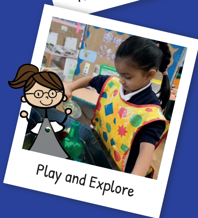
Play and Explore

In November 2021 we were awarded the Silver National Teaching Award for 'Lockdown Hero' for outstanding Learner and Community Support. Our team worked tirelessly to support the community throughout lockdown and came up with creative ways to engage the children virtually.